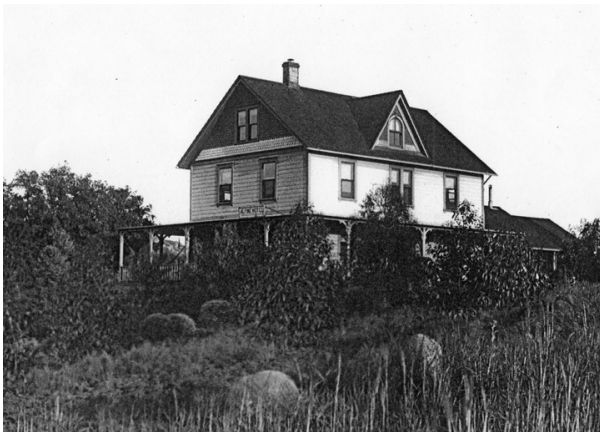
Alpine Hotel, 1890 The hotel was located on the southwest corner of Tavern Road and Arnold Way. It was later known as Ye Alpine Tavern and burned down on September 17, 1955.