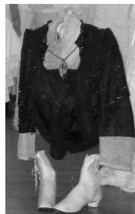
A lovely top and shoes