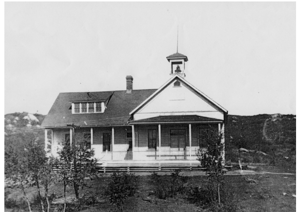
The Town Hall, 1899 On the northwest corner of Alpine Boulevard and Victoria Drive—now the Alpine Woman's Club.