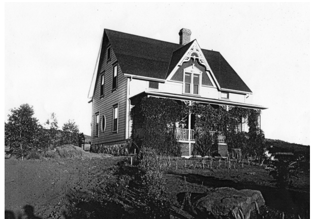
The Parsonage, 1893 It stands today on the original site on Tavern Road just south of the Arnold Way and Tavern Road intersection. Now known as Kasitz Kastle Retirement Home.