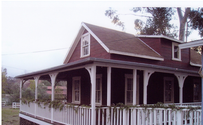
The Beaty House is shown at left with its festive garlands of local greenery and pinecones—a sight to behold!