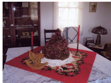
Pioneer Decorations—Beaty House