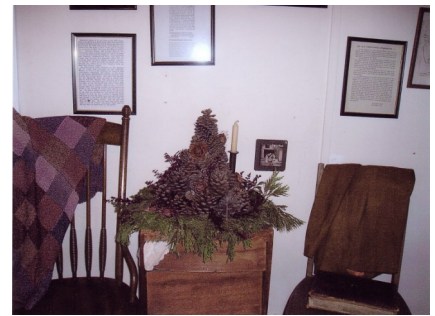
Below: Katie Ford's Tree Top.