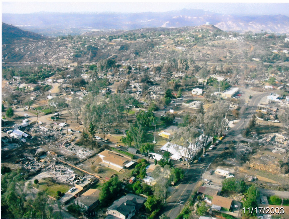
Aerial view of Crest