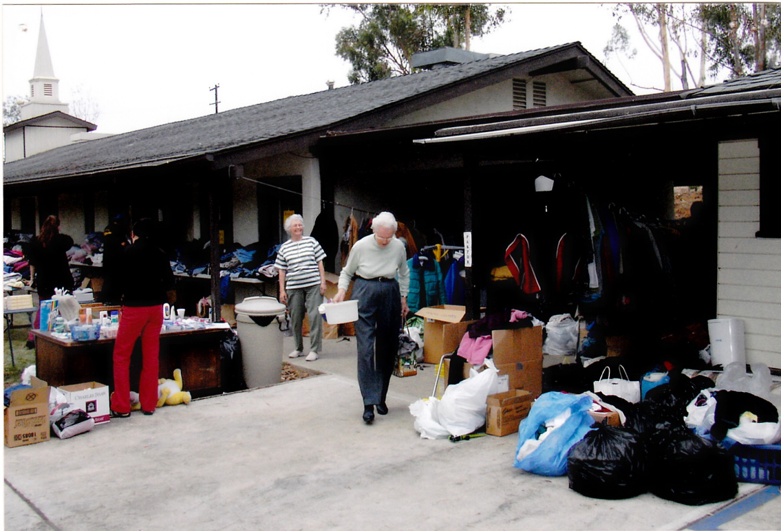
Church used as donation center—corner of Tavern Road and Arnold Way