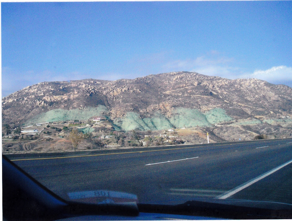
Interstate 8 before Alpine