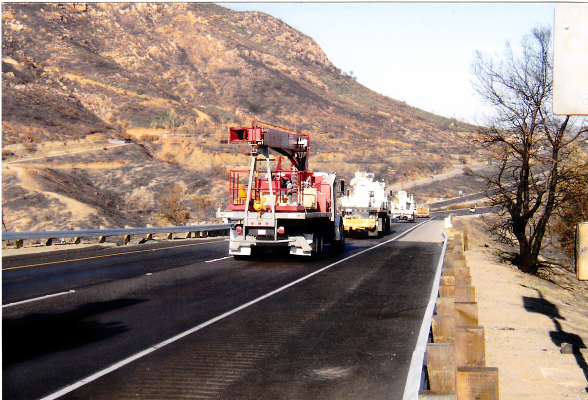
The utility trucks on the way to restore power