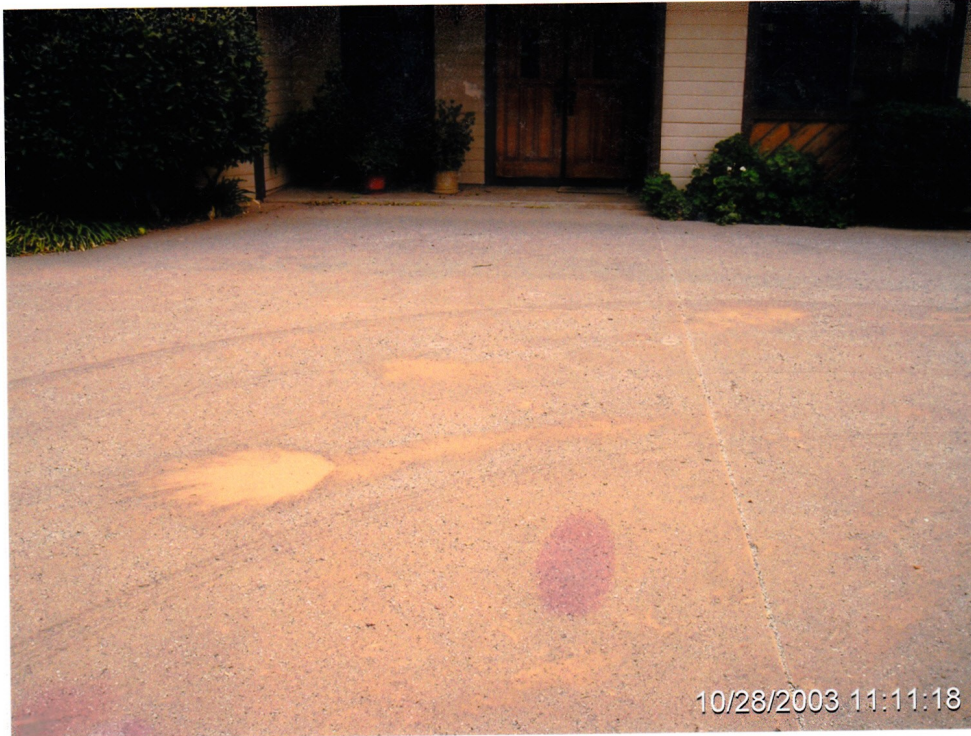
South of Interstate 8 at Harbison Canyon