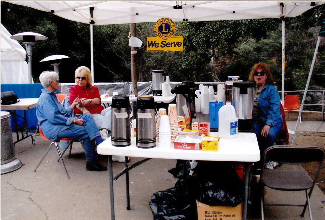
Aid Station—Lion's Club