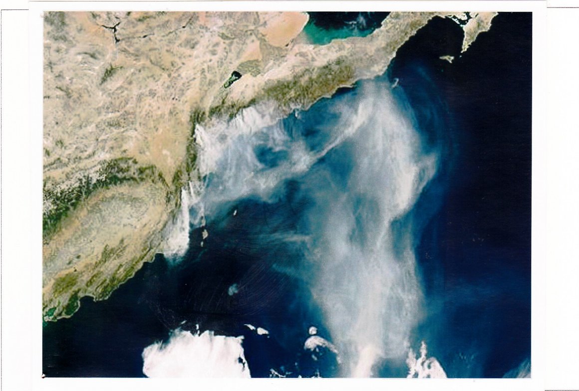
Smoke as seen from the sky