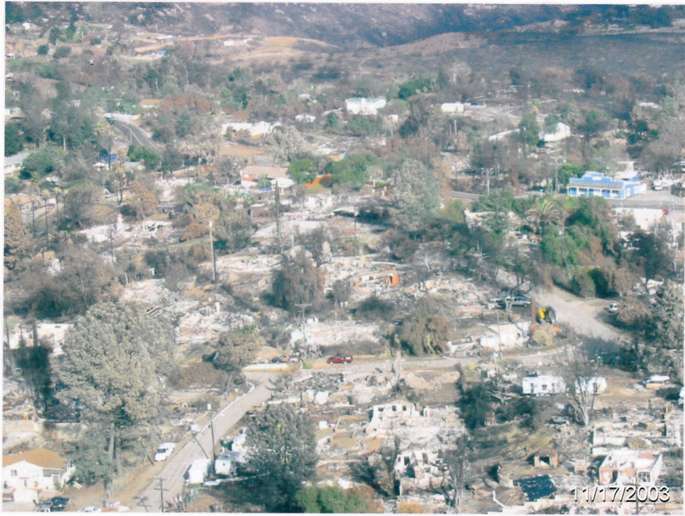
Aerial view of Crest