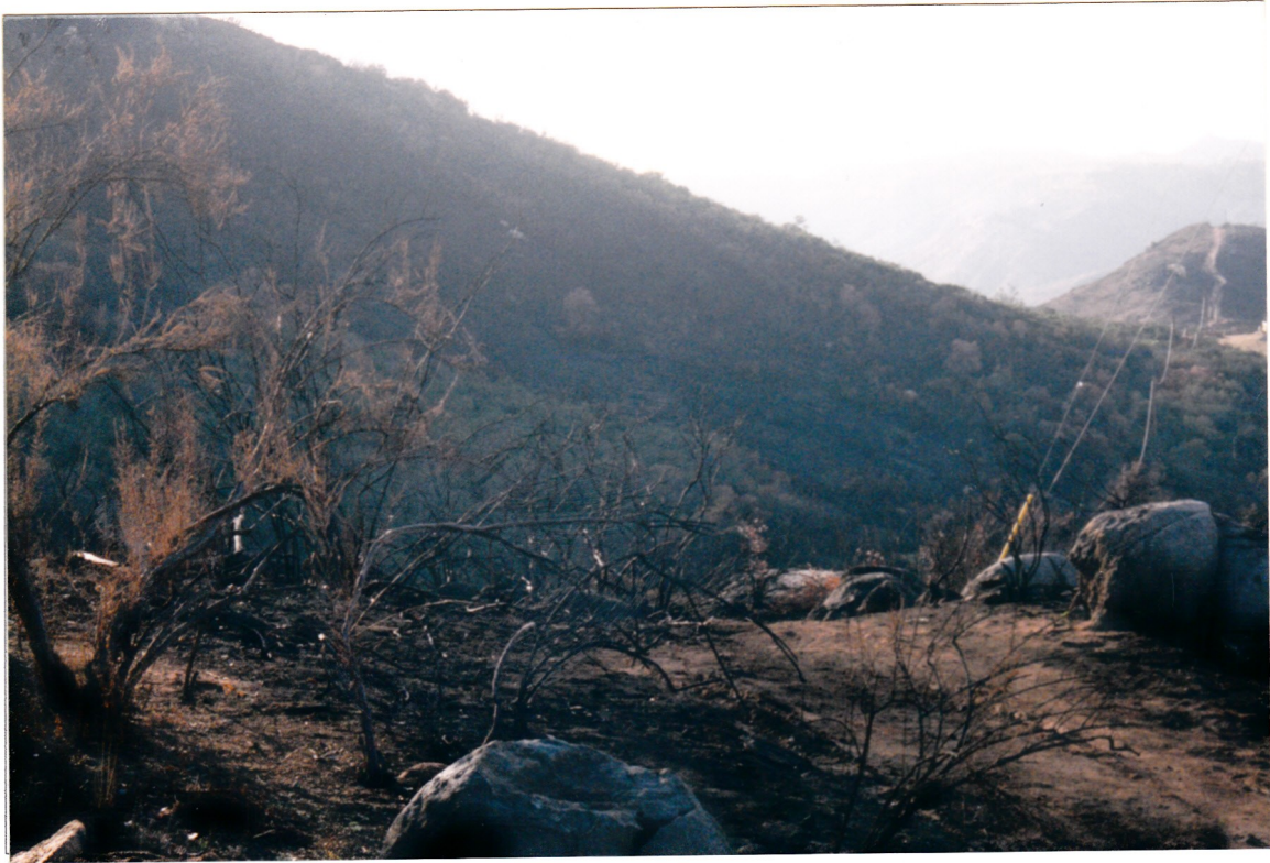
Alpine Heights area—off of Mackenna and Via Corina