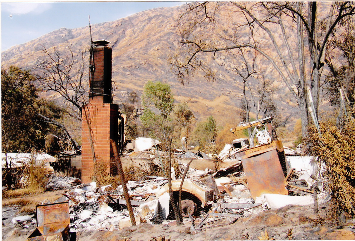
Looking West on Anderson Road