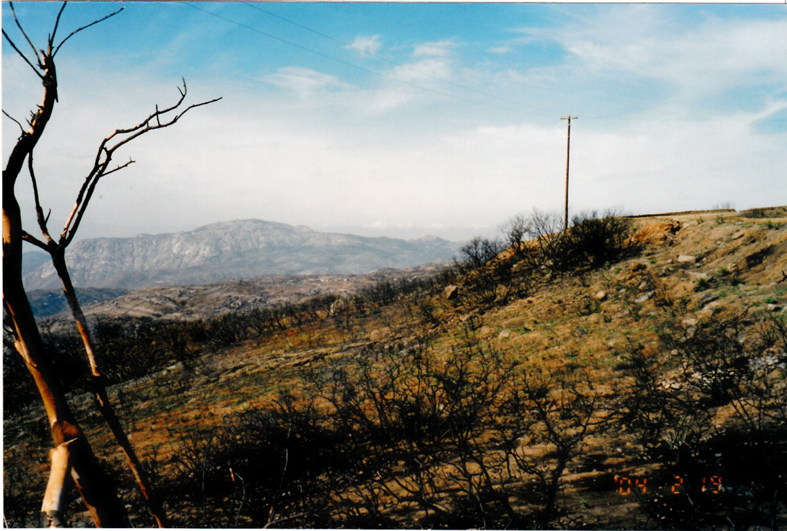
Behind Crown Hills looking toward Viejas Mountain--East