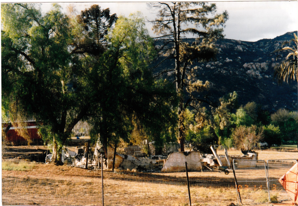
South Grade Road