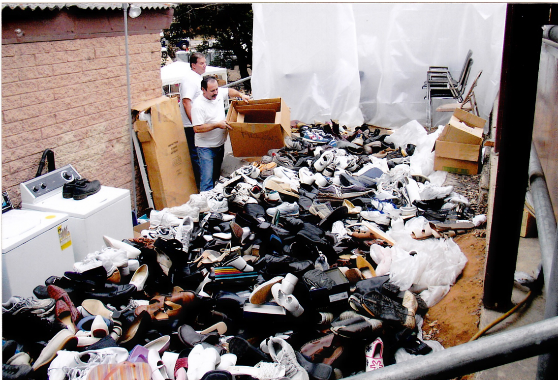
Donations poured in to help those that lost everything