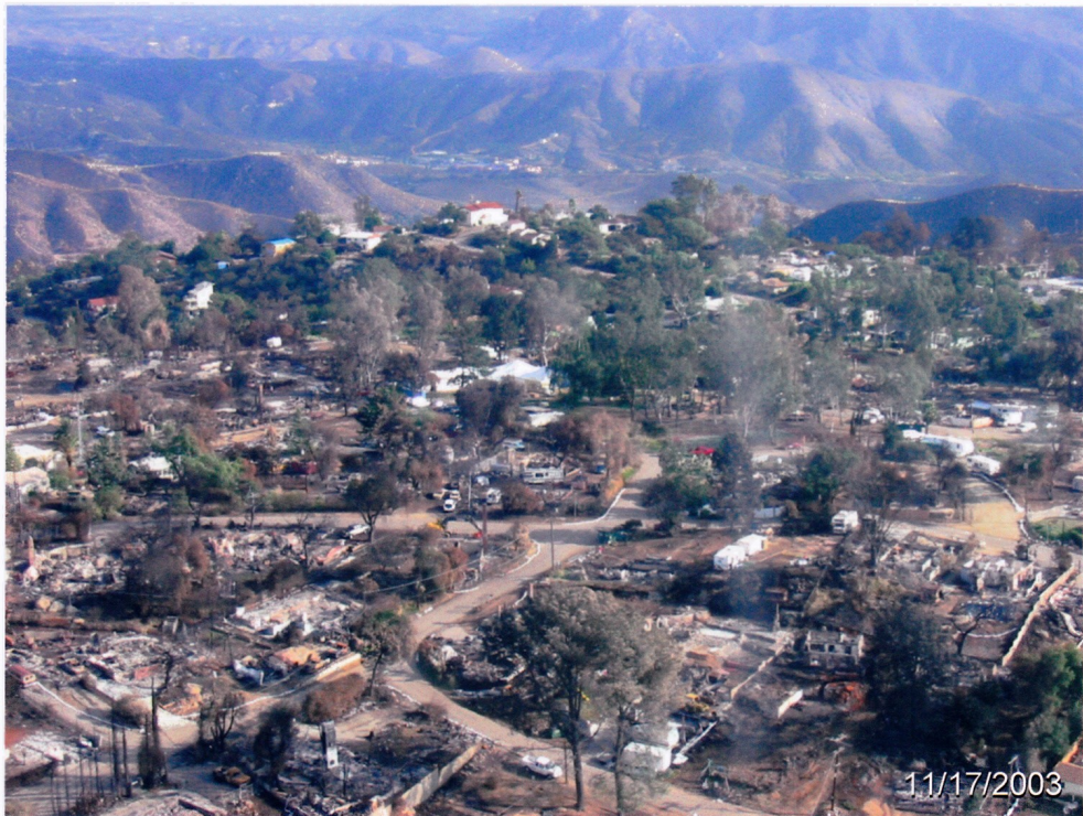
Aerial view of Crest