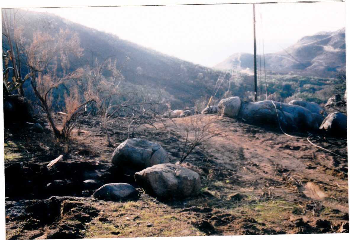
Alpine Heights area—off of Mackenna and Via Corina