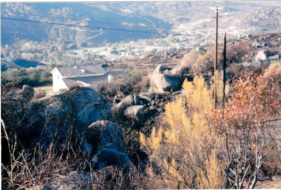
Alpine Heights area—off of Mackenna and Via Corina