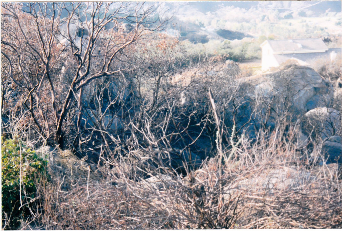
Alpine Heights area—off of Mackenna and Via Corina