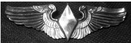
Bottom Left: W.A.S.P. Wings worn by 1,074 women during WWII (out of 25,000 who applied and 1,830 who were accepted) who successfully completed the Women Airforce Service Pilot training program.