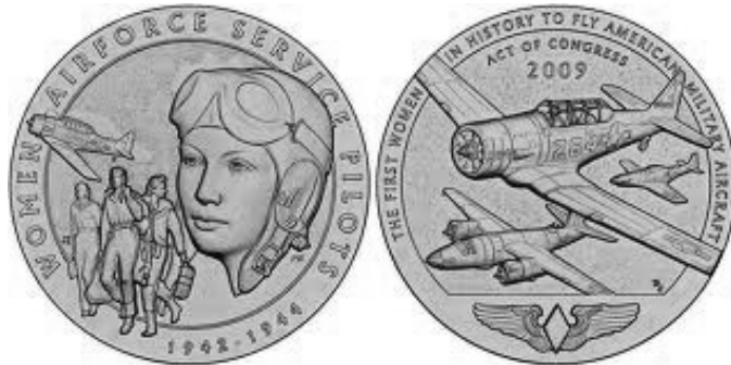
Women Airforce Service Pilots Congressional Gold Medal The medal features the portrait of a W.A.S.P. in flight headgear with three other W.A.S.P.s in period uniforms with an airborne AT-6 in the background.

During a time of national crisis, thousands of women answered their nation's call and volunteered for duty as