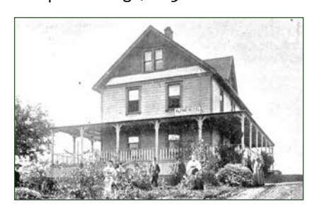
Alpine Hotel - J.R. Campbell, Proprietor

Alpine is reached by a ride of twenty-one miles over the Cuyamaca railroad from San Diego to Lakeside, thence by a charming staging trip of eleven miles over a good road and behind fast horses, the whole trip being made in four hours' time, the fare from San Diego to Alpine being $1.25.