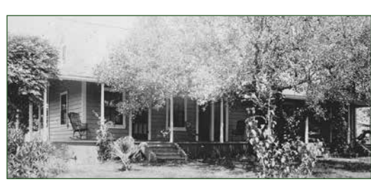
The Oaks -J.A. Love, Proprietor

The altitude of the Alpine country varying from 1,500 to 2,500 feet, gives a variety of temperatures and conditions of climate, some of which are found to meet the requirements and desire of all who avail themselves of it. While those who are seeking health find a friend in the climate of Alpine, it is none the less beneficial to those who have lived near the coast long enough to have become tired of the monotony of its even temperature and ocean breezes.