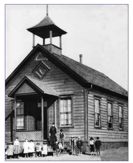
One-room School House

The present generation don't know what hardship is. They see too much, hear too much, and want too much, are never satisfied.